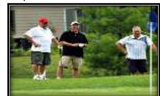
A few of the golfers at one of the tees.

"G", a single mom who enrolled with her 4 children. She attended SCS classes but her main points of focus was finding her next home. She secured full time employment almost immediately and within two weeks, she found her new place, affordable, clean and price range friendly.