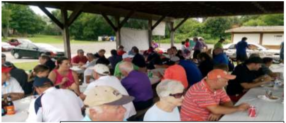
2 nd Annual Tin Cup Golf Outing participants enjoying food donated from food and beverage sponsors Swingbelly's Great Food and Spirits, Scarzotti's Trattoria, Al's, Carlson's Drive-In, Meijer's, Three Sheets Bar, Knuckleheads, Top Doq, McDonalds and KFC.

In our fiscal year just ended, nearly 80% of SCS residents graduated to permanent housing and nearly 70 increased their income while at SCS