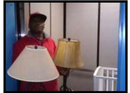
One of the many KTH participants helping to organize furniture for a community partner.

Participants are also continuing to volunteer in the community with organizations such as A Hand UP, Barker Mansion and other local agencies. Although much has been achieved in the short time that we have been open, KTH is looking to do more and to continue to collaborate with community partners in the effort to eradicate homelessness in La Porte County. We are truly grateful for the support of the community!